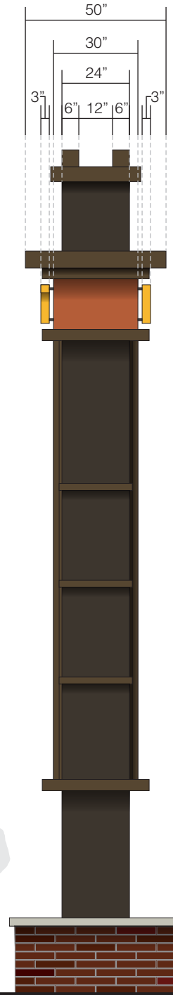
B Pylon Sign - End View Scale: 1/4" = 1'-0"